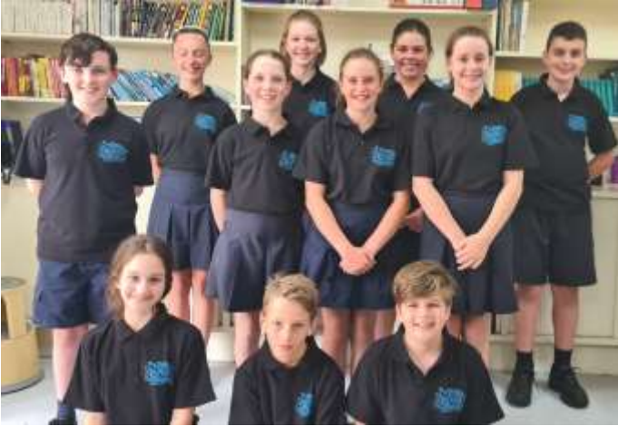
2021 Leadership Group