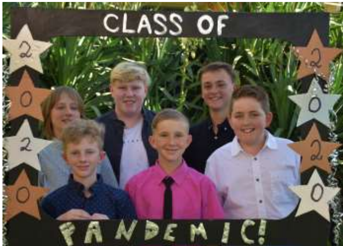
Some of the Graduating Class of 2020