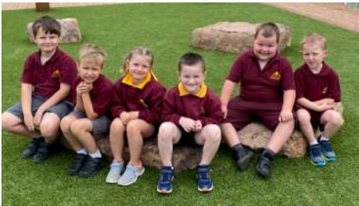
Foundation students enjoying their first day of school.